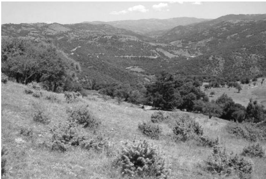
Slika 3. Stanište ridoglavog svračka Lanius senator u dolini Pčinje. Figure 3: Habitat of Woodchat Shrike Lanius senator in Pčinja river valley

Crvenoglavi svračak u dolini Pčinje pokazuje visok stepen vezanosti za suve livade okružene degradiranim hrastovim šumama ili voćnjacima (Slika 3), na kojima su se nalazile sve zabeležene teritorije. Ovaj tip staništa predstavlja fragmente sa najjačim egejsko-mediteranskim uticajem (Stevanović, 1995), i čine ga livade sa niskom travom okružene žbunovima i pojedinačnim stablima ( Quercus petraea , Q. pubescens , Juniperus communis , J. oxycedrus , Crategus monogyna , Pirus pyraster i dr.) ili voćnjacima ( Malus domestica , Prunus sp.)