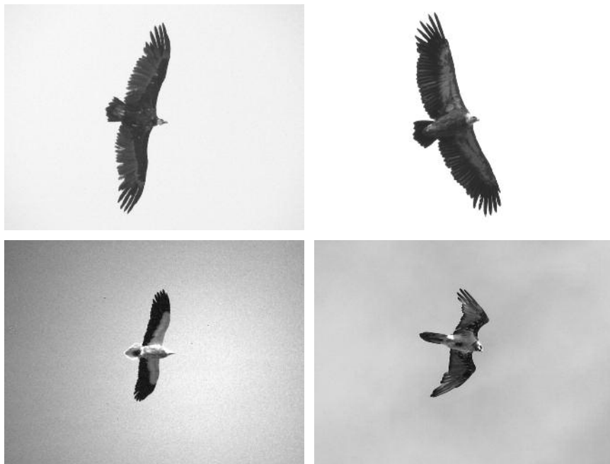
Slika 1. Sva četiri evropska lešinara još se gnezde na Balkanu: crni strvinar Aegypius monachus (gore levo), beloglavi sup Gyps fulvus (gore desno), bela kanja Neophron percnopterus (dole levo) i bradani Gypaetus barbatus (dole desno).

zabeležen je stalni rast brojnosti, a 2008. zabeležena je maksimalna brojnost od 104 gnezdeća para (koja su započela inkubaciju). To je najveća brojnost beloglavog supa koja je ikada dosada zabeležena od kako se ova vrsta prati u Srbiji (od 1971–1972). Najveća koncentracija brojnosti ove vrste danas se na centralnom Balkanu nalazi na području Srbije: beloglavi sup postao je simbol zaštite prirode u Srbiji.